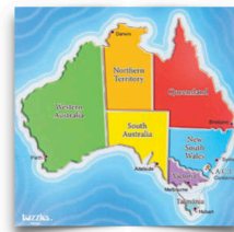
B: Law of the Sea. Maritime 'Law'.

88. It is fair to say that the grid of image B, has laid itself over the boundaries of image A, without