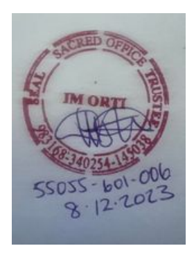
Leith Masters First Nation Sovereign Council Co-Executive Trustee for Humanity -Terra Australis Sovereign Peoples Assembly SPAWA Sheriff: SPAWA